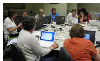
Teachers as Learners - using PowerPoint as an animation tool.