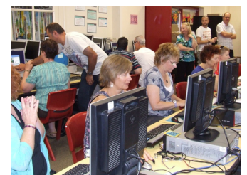
Workshop participants January 24, 2011

Our Place is one state-wide project supported by ABC Local Radio. Click here to read an article on this project, published by ABC Local Radio 5 November 2010.